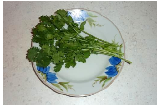
14. Take cilantro greens