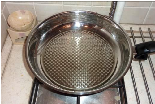
21. Pour oil into a frying pan