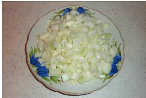
6. Cut the onion into medium squares