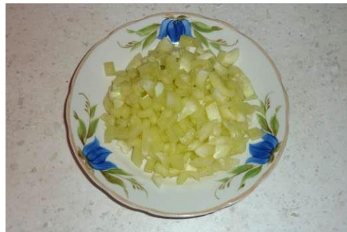
10. Cut the green pepper finely