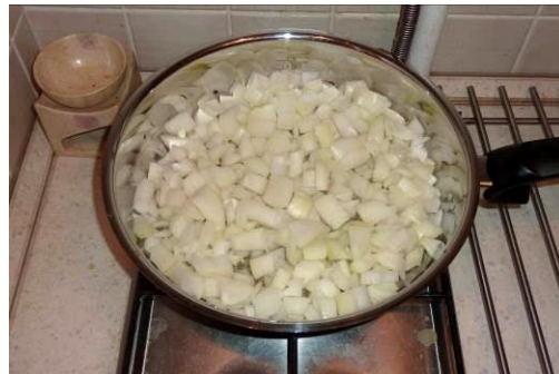
22. Put the onion in the frying pan