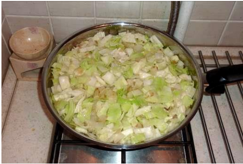
25. Mix the onion and cabbage