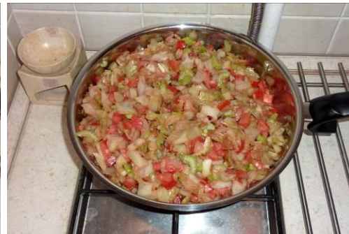
31. Stir and simmer