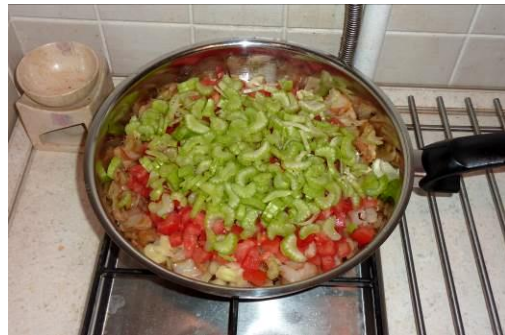
30. Put the celery stalk in the frying pan