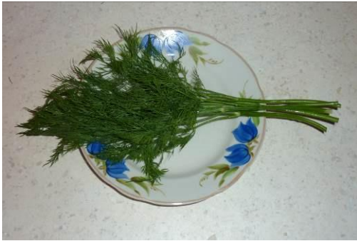
13. Take dill greens