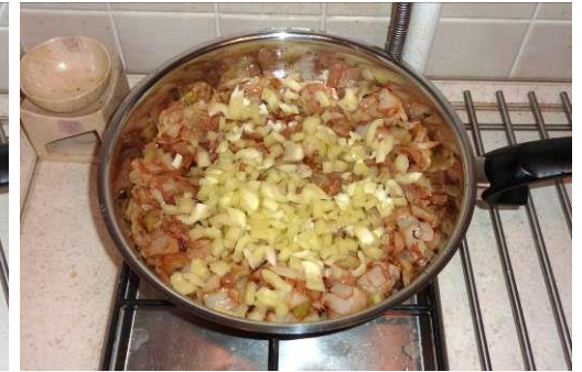
28. Put the green pepper in the pan