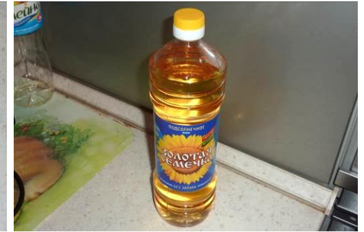
16. Take vegetable oil