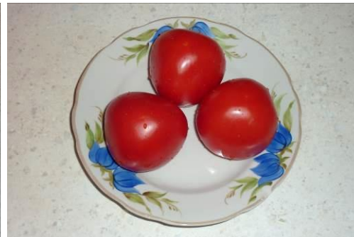
7. Take the tomatoes