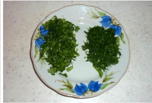
15. Chop the dill and coriander finely