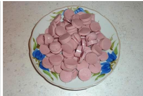
19. We cut the sausages finely