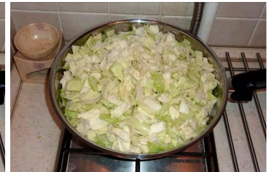
24. Put the cabbage in the pan