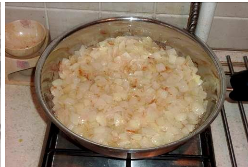
23. Fry the onion until golden brown