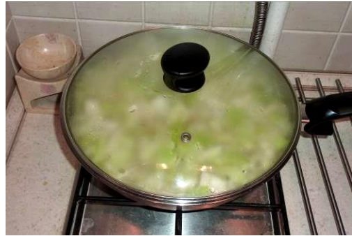
26. Cover the pan with a lid and simmer on low heat