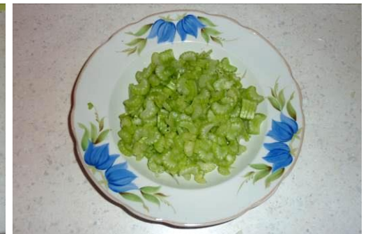
12. Cut the celery stalk finely