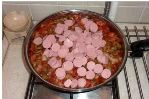
34. Put sausages and mix