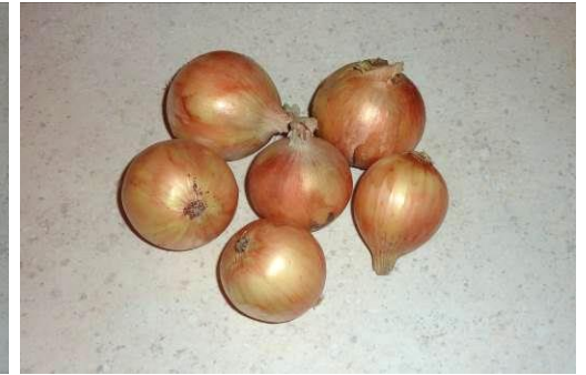
4. Take onion