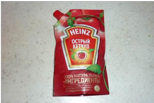
17. We take ketchup