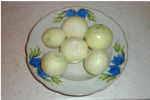
5. Peel the onion