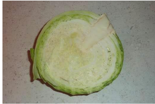
2. Measure a portion of cabbage