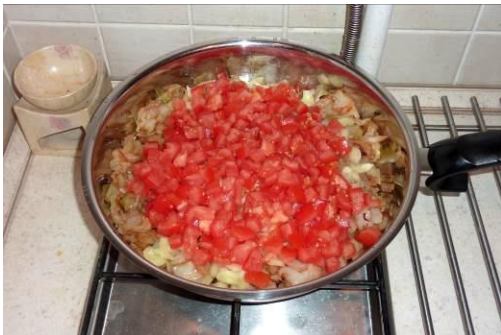
29. Put tomatoes in a frying pan