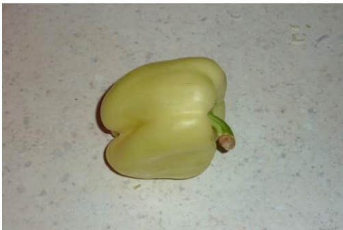
9. Take green pepper