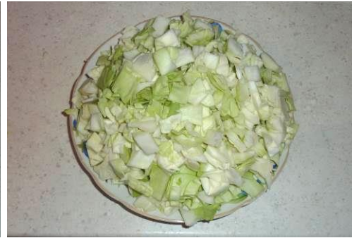
3. Cut cabbage into medium pieces