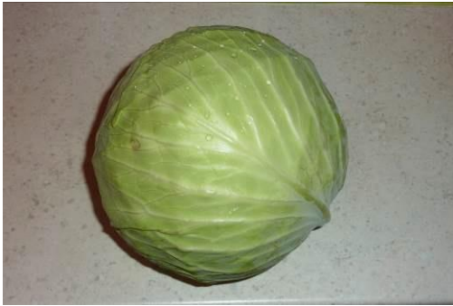
1. Take white cabbage