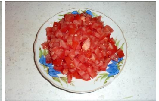
8. Cut the tomatoes finely