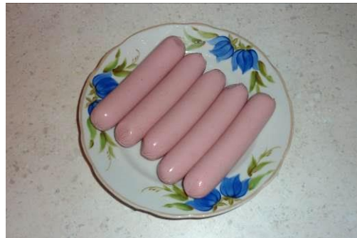
18. We take milk sausages