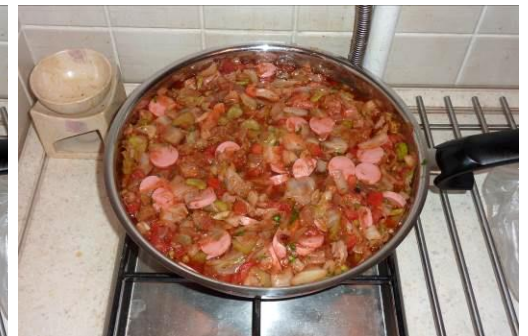
36. Stewed cabbage is ready