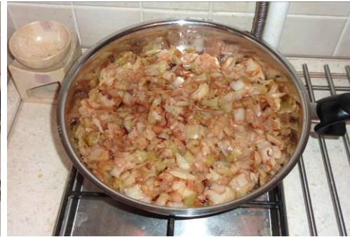
27. Periodically mix the contents of the pan