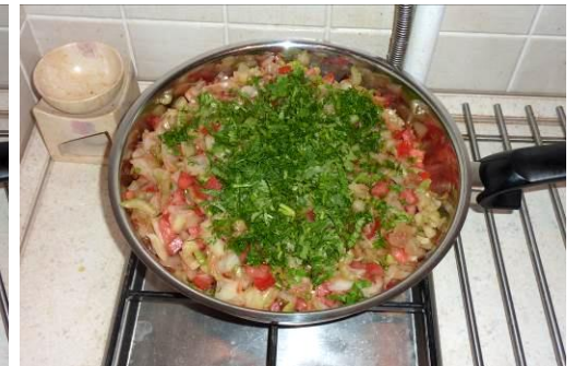
32. Put the greens and mix