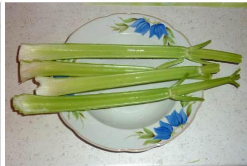
11. Take the celery stalk