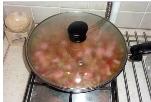
35. Simmer under the lid on low heat