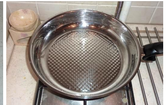
20. We take a frying pan and put it on fire