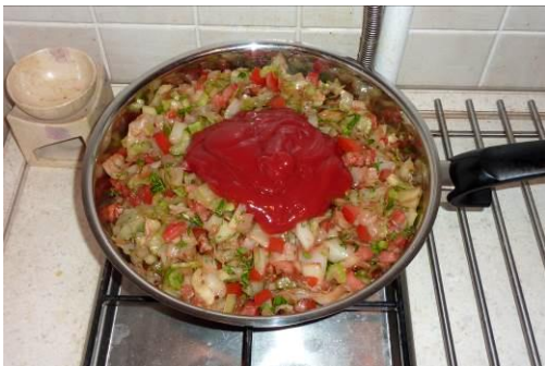
33. Put ketchup and mix